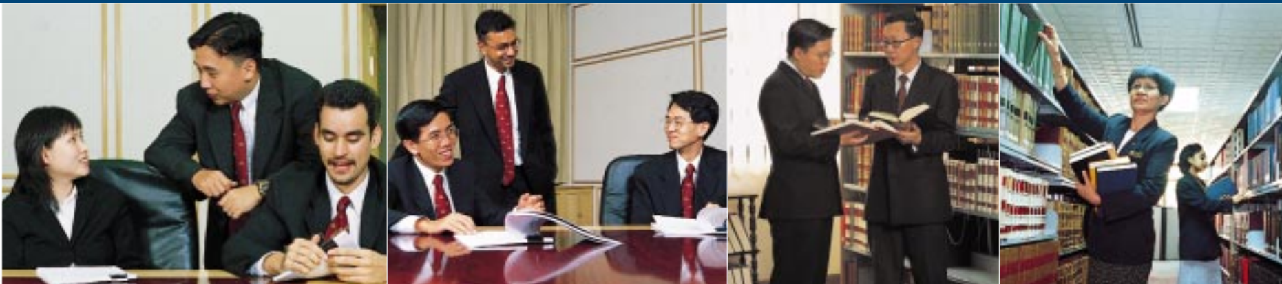
Judicial officers at lunchtime meetings