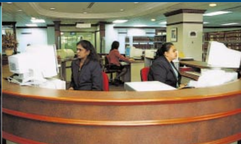
At the Research and Resource Centre