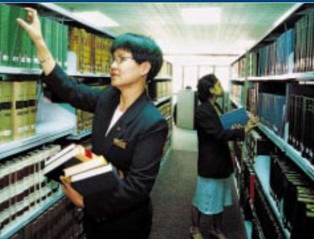
Librarians at work