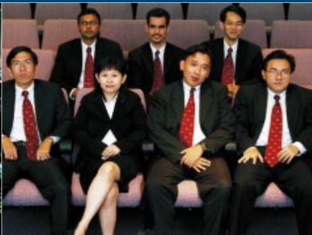
Listening to a lecture