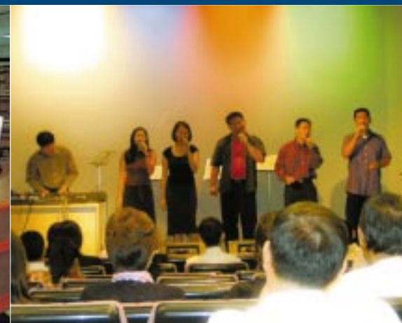
The Key Elements in concert

Division of the National Centre for State Courts/Institute for Court Management. Her work focuses on improving the justice system in relation to family violence. She is also currently an adjunct professor at the College of William and Mary in Williamsburg, V.A., United States of America. Due to the time difference, the video-conference was held at Singapore time 3:00 to 4:15 am.