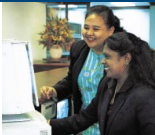
Using online research facilities