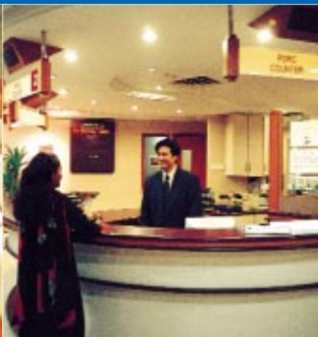
A friendly welcome at the Multi-Door Courthouse