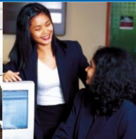
Multi-Door Courthouse officers