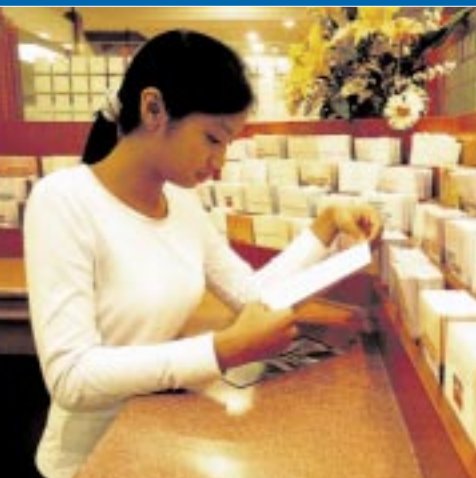
Reading an information pamphlet