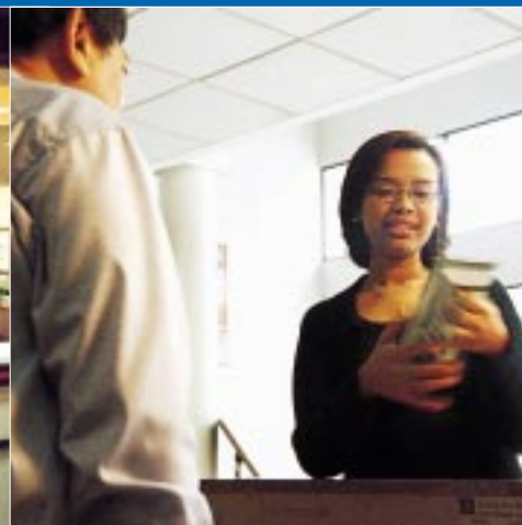
Attending to a member of the public